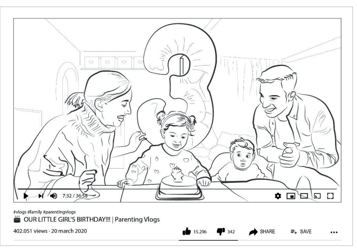
Figure 2. Rendering of a screenshot of a family event

In this case, the hypothesis was not completely proven, since the degree of intimacy does not seem to be high in videos where commercial content and corporate collaborations are the main focus. However, in terms of intimacy, aspects such as the youtuber's thoughts, beliefs and ideas stand out, as well as the presence of family, friends, and minors in their daily routine.