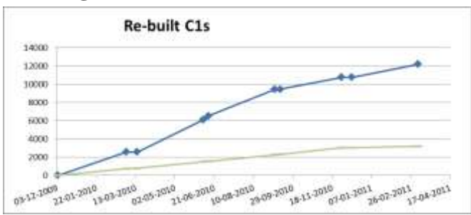
Figure 1 - Max and min kilometres driven by re-built C1s during test period.