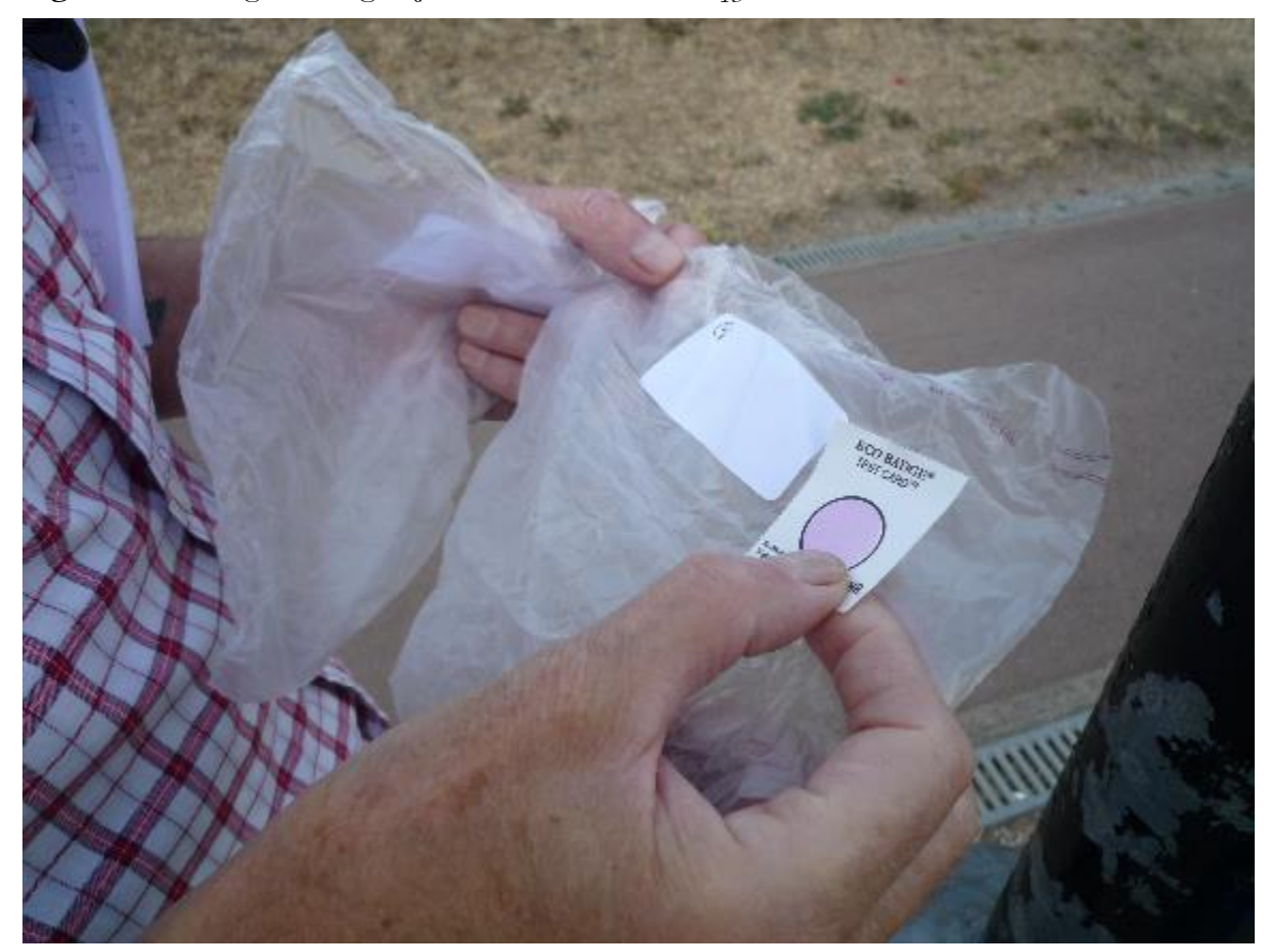
Figure 2 – Testing Eco-badge ozone detection kits on the Pepys Estate.

After a meeting in the local community centre, Mapping for Change provided residents with instructions and survey equipment to carry out their investigations. The area of the estate was divided up into 100-metre grids to obtain a good distribution of samples taken. Activities commenced with a series of diffusion tubes being set out on lampposts around the area. Wipe samples were taken to assess the quantity and type of metals being deposited on vertical surfaces. Ozone levels were measured using Eco-badge<sup>TM</sup> ozone detection kits (see Figure 2), and leaf samples were collected and analysed by Lancaster University. All the data collected was analysed and compiled into a series of maps. A public meeting was held to provide feedback on the findings. As a result, the local authority (Lewisham) installed diffusion tube monitoring devices at the main junctions identified by the project as having higher levels of NO<sub>2</sub>. Levels of NO<sub>2</sub> in London are largely from vehicle exhausts and are also a strong indicator of the presence of other air pollutants derived from vehicle emissions. The council also installed a PM10 particulate monitoring station in the neighbourhood to monitor the local situation. Previously, the closest fixed monitoring station was just over a kilometre away.