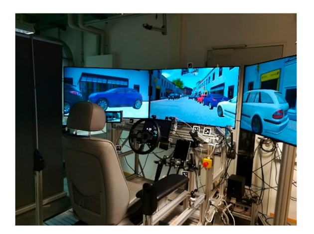
Figure 4. Mock-up used in this study.

monitors, displaying a 120° field of view including the rear mirror. Two additional displays represented the side mirrors. The instrument cluster featuring the developed HMI was displayed on a 13″ monitor located behind the steering wheel. Steering wheel and pedals (by SensoDrive) and a motion platform from D-BOX (to induce pitch and roll motions) were installed. The simulator was run with the driving simulator software SILAB 6 from Würzburg Institute for Traffic Sciences (WIVW).