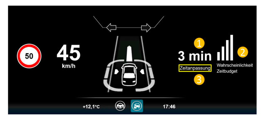
Figure 2. Visualization of the advanced HMI including: time budget (1); confidence level (2); and message time budget adjustment (3).