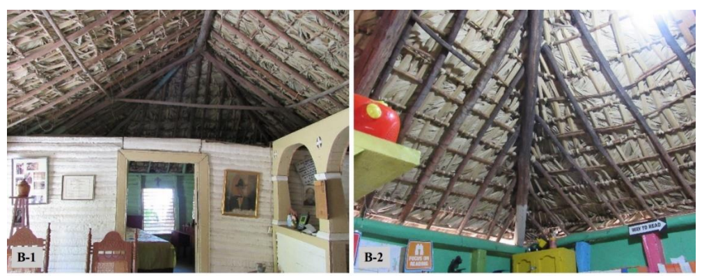
Figure 2. Bohios (B-1 and B-2) with a cana palm leaf roof.

The bohios B-1 and B-2 with a Cana palm leaf roof is a type of vernacular housing commonly used in the Valle de Baní, consisting of a simple volume with a rectangular floor plan, with a gabled roof and small eaves that protect the four facades. Its supporting structure is based on wooden forks, buried in the ground, joined at the top by the sill, on which rests the lock that supports the thick cover of cane palm leaves ( Sabal dominguensis ). The walls of the house and the internal divisions are made of planks of royal palm ( Roystonea hispaniolana ) placed horizontally, overlapping and nailed to the horcones or posts, which in this region are usually made of mahogany ( Swietenia mahagoni ) or creole oak ( Catalpa longissima ). For the structure of the roof, we used uncarved sticks or poles from various local timber trees (Fig.2).