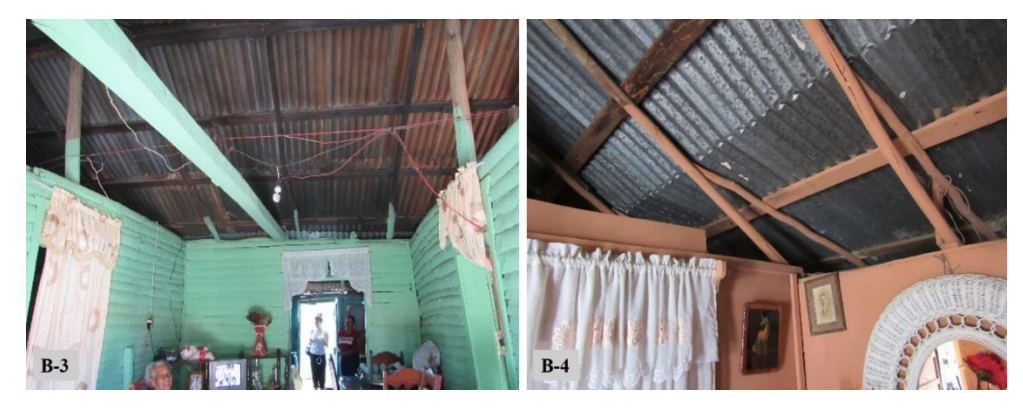
Figure 3. Bohios (B-3 and B-4) with corrugated zinc sheets on roofs.

to integrate the kitchens into the house and add another bedroom. The interior walls, as in B-1 and B-2, remain at the height of the sills, allowing air to flow over them. The B-3 also has fans over the doors, which contribute to the good ventilation of the interior of the hut.