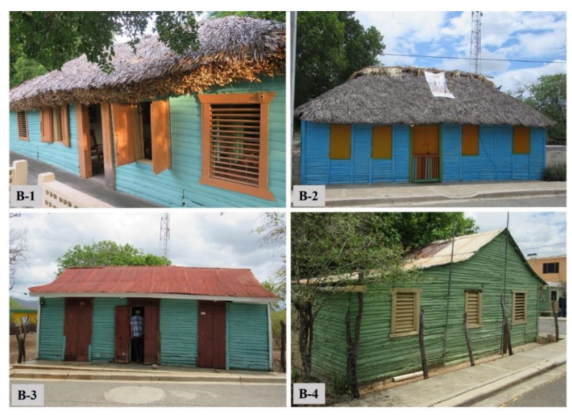
Figure 1. The four houses assessed.

Four houses were assessed for this research all located in the Baní Valley, province of Peravia, in the south of Hispaniola Island. Two of them with roofs of cana palm leaves (B-1 and B-2) and two with roofs of corrugated zinc sheets (B-3 and B-4), The B-1 is located in Villa Sombrero and B-2, B-3, B-4 in Sabana Buey (Fig. 1).