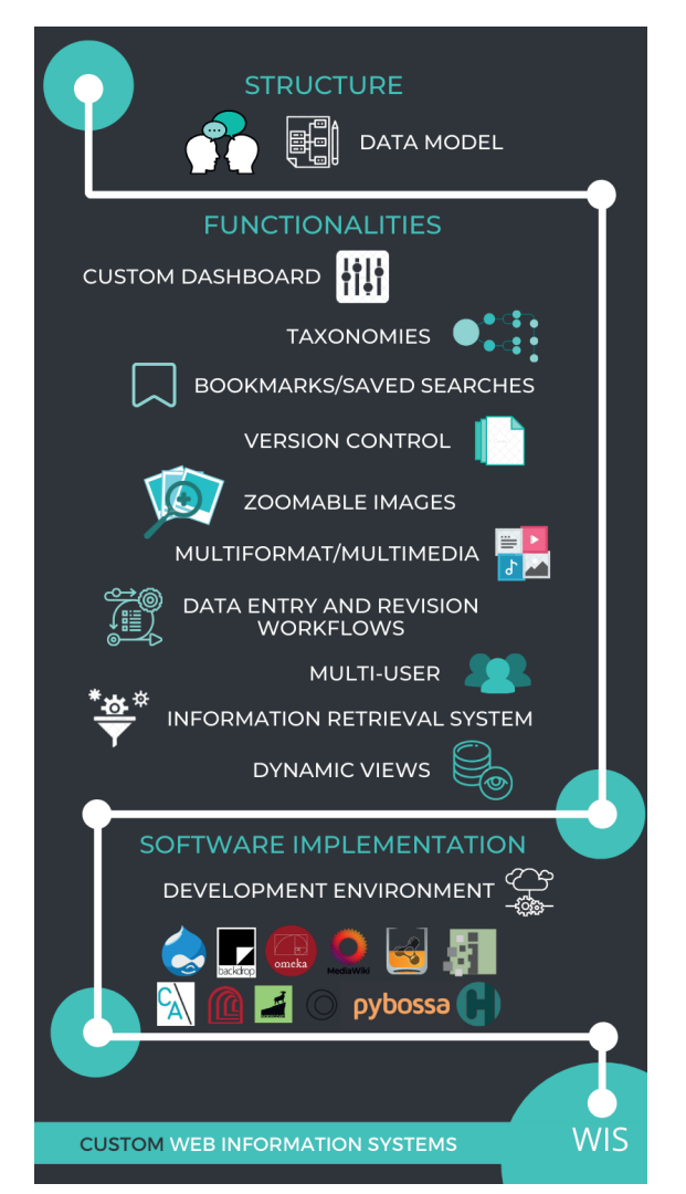
Figure 1. Infographic of the core phases in the development of a customized WIS.

Humanities can no longer ignore IT solutions to manage the rising amounts of data and information they produce, and to support knowledge generation through quantitative approaches, which have progressively grown in popularity. Research in the humanities increasingly depends on how information is structured and managed and how, based on that information, new knowledge is produced through interpretative processes. Additionally, participatory approaches, which often rely on WIS as their supportive infrastructure, have made an impact on the most recent historiographical trends, in particular in the methodological framework of public history and digital public history (Gallini; Noiret, 2011; Noiret, 2018; Pons, 2018). A growing interest from society to participate in co-creative and collaborative projects in the humanities and CH has been detected (Bocanegra-Barbecho et al., 2017; Bocanegra-Barbecho, 2020), through social networks and within the framework