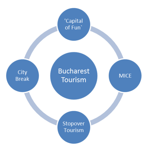
Figure no. 1: Tourism development opportunities in Bucharest

Another subject tackled in the interview has been whether the fact that Timisoara will be the cultural capital in 2021 could contribute to tourism development in Bucharest (question no. 9). Respondent 2 considered that it would have a positive impact in terms of image, professionalizing the workforce and also if there would be some events organized together or activities for tourists transiting Bucharest. The other respondents agreed that this could potentially generate more transiting passengers, therefore, potential tourists but they emphasized that, given the current situation and the lack of a coherent tourism strategy, there are not many chances that this happens.