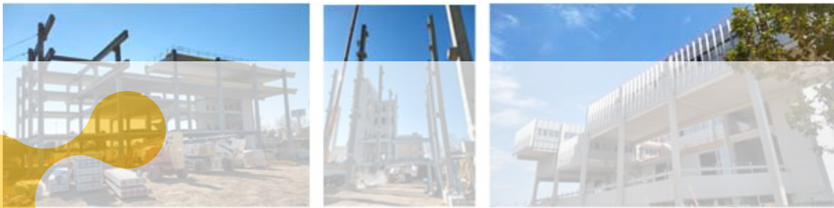
Figure 2. Prefabricated structure during the construction phase of the Socrates building.

The structure is constructed from a prefabricated concrete frame composed of 0,60m x 0,80 m pillars that span the full height of the building as a single element without vertical interruption in addition to horizontal beams with a section of 60 x 80 cm that connects to the vertical structure. Pillars are distributed across a 10 x 10-meter grid, with a 100m 2 free areas that guarantee the highest spatial flexibility for any tertiary and light industrial use. Prefabricated hollow-core slabs complete the horizontal enclosure and give structural stability to the frame.