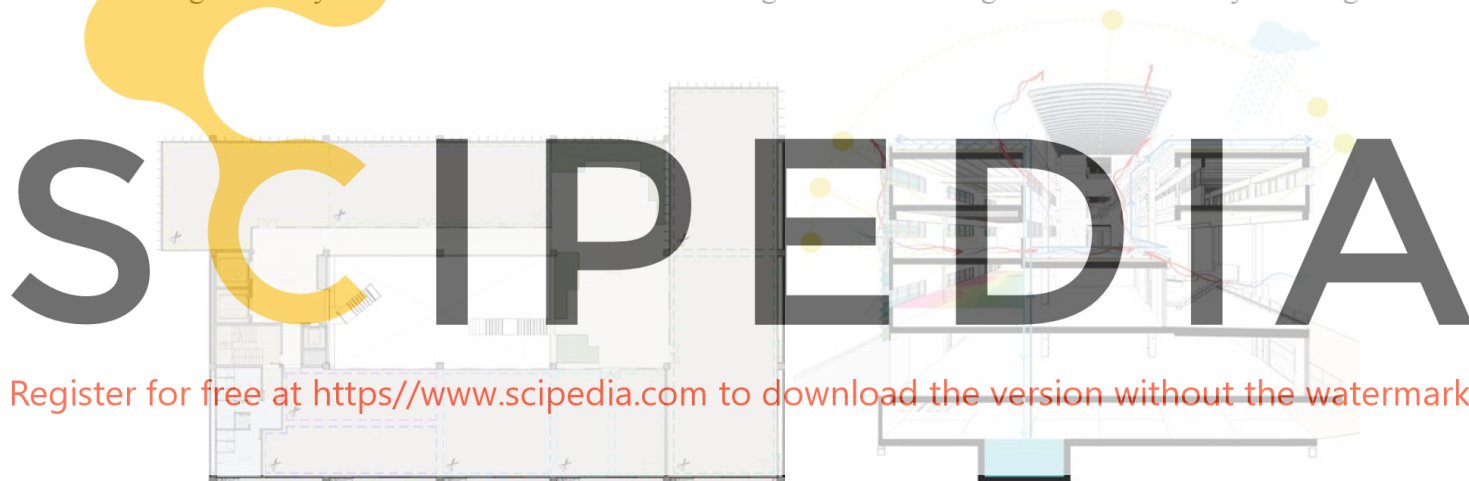
Figure 1. Type floor plan with interior subdivision schemes (left) and section (right) of the Socrates building.

Another keystone in the design was to support direct access to nature and open spaces with vegetation, natural ventilation and direct access to daylight and views. Each floor plan possesses open space equipped with vegetation, irrigated with recovered rainwater. The LEED v.4 certification protocol was adopted to better structure all of the aspects related to sustainability, this decision was taken in accordance with an analysis of the office buildings market in Barcelona where the majority of buildings with environmental certifications have a higher real estate value and higher rental potential (Eje Prime, 2018). A final practical aspect of the design and construction phase was the implementation of an integrated delivery process (IDP) that aligned every stakeholder towards the common goal of conceiving a circular economy building.