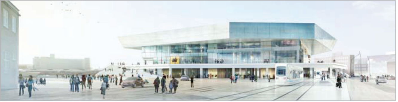
As a part of the project Urban Mediaspace , the city of Århus has build the new library Dokk1 , on Århus harbour by the mouth of the river

and break the circle of loneliness. The desire to learn for oneself, but also help others, encourages many people to be active and participate in the activities of civil society.