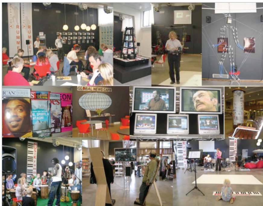
New times, new library activities (Schulz, 2014)

to-date resources relevant to their needs, including digital content.