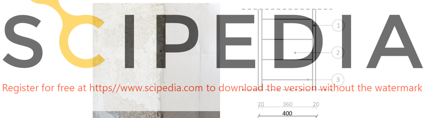
Figure 2. Wall system: 1-plaster (thickness: 20 mm); 2-hempcrete blocks (thickness: 360 mm); 3-bedding mortar.

Currently, the data collected in the Sicilian campaign have been elaborated, the reference standards are UNI EN 15026:2008 and UNI EN ISO 13788:2013. The measurements have been performed on the South-West, South-East and North-West walls for 13 days (in August) during which the inhabitants were not present to exclude the influence of the air conditioning system. The wall system is 400mm thick (Figure 2): the hempcrete blocks have a thickness of 360 mm, the ratio between dolomitic lime and hemp shives is 3:1; the plaster is premixed, constituted by hydraulic lime NHL 5 and it has thickness of 20 mm both on the internal and on the external face of the walls. The bedding mortar is characterized by a dolomitic lime-to-hemp shive ratio of 3:1.