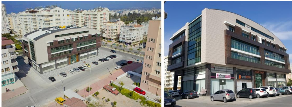
Figure 2. East facade of the building.

The building is located on the intersected corner of Portakal Çiçeği street and 1460 street in Antalya, Turkey. It is a seven storey-high residential building on the right with a distance of 8.40 meters, ten storey-high residential building on the back with a distance of 14 meters and front with a distance of 40 meters and two storey-car parking on the southwest with a distance of 21.5 meters. The main entrance faces to east (Figure 2). This facade always takes the sun directly without having any shading areas. The temperature and the light play a crucial role on materials. 1460 street and Portakal Çiçeği street have intense traffic. This causes air pollution which may create deterioration. The distance from the sea is 1 km and the height of the building from the sea is 22.5 m. The pedestrian roads and the vegetation around the building can be seen in Figure 3. There is an open area in front of the main facade. There are also car parking areas on the east and the west facade.