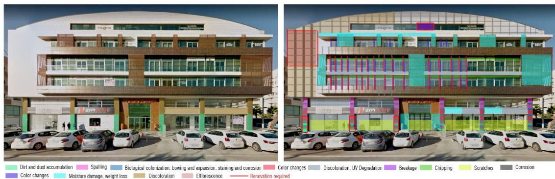
Figure 5. Facade of the building (on the left), facade of the building in 30 years (on the right).

Because of the location of the facade, air pollution may cause wet deposition where there is no rain-wash. This may cause gypsum crust (Agnes et al. 2012). Observations after the rain showed that, some part of the ceramics dry longer than the other parts. Condensation can lead to mold growth, noxious odors and deterioration of building finishes of the panels (Campante and Paschoal, 2002). Biological activity would be seen on the cracks of the ceramics (Agnes et al. 2012). Cracking occurs when thermal movement isn't provided (Goldberg, 2002).