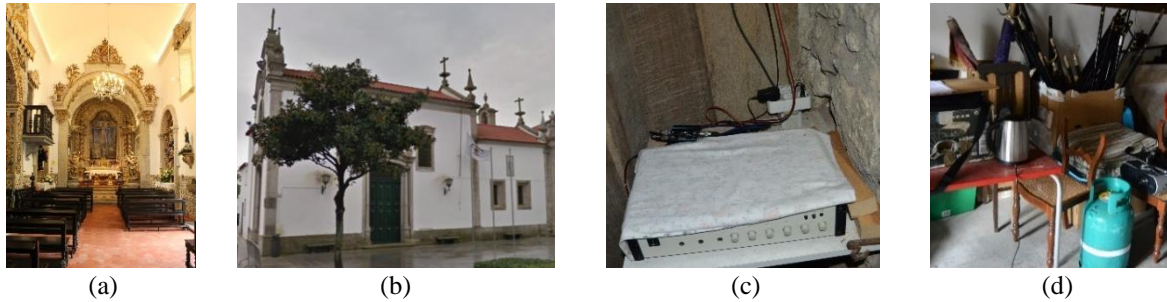
Figure 1: (a) Main Altar; (b) Exterior View; (c) Extension cords behind the main altar; (d) Storage room.

The second case is the 14 th century Museum of Carmo in Lisbon, Portugal (38°42'43.5"N 9°08'25.4"W). The BP group was ranked as D, given that, in P_5 , r < 1 and nl \leq 2 . P_3 was graded as C since the largest compartment has approximately 190 m 2 . P_1 and P_7 were graded as B due to the current use of the building (being a museum 80% with non-combustible material leads to a fire load of 500 MJ/m 2 ) and the existence of vegetation 5-30m away from non-combustible materials, respectively. The other parameters of BP were graded as A, due to the non-combustible materials of the walls and the type of adjacent buildings ( P_2 and P_4 ), and the good level of conservation of the few combustibles in the structure ( P_6 ). In terms of UEGPT, the building was graded as B, given that utilities are in good condition, the technical room is in the exterior but near the administrative zones, there is a CCTV system (Figure 2b) and the building is in a moderate criminal area. FM is graded as C since there is a fire suppression system (Figure 2a), an alarm and detection system (Figure 2b), a passive smoke control system (atrium), water supply and the firefighters are less than 10min away. Even though P_{20} leads to