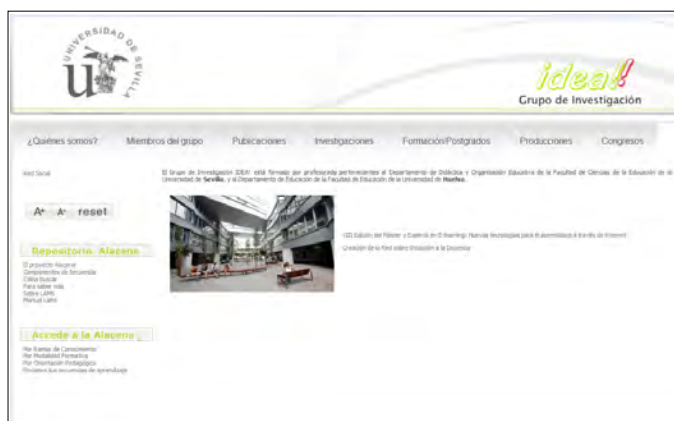
Figure 1. Screenshot of the web page and the Alacena repository: http://prometeo.us.es/idea .

Since its creation, Alacena has been an open resource available to university teaching staff with the sole purpose of allowing them to find the representation of a variety of highly innovative learning sequences that can help them to effectively design their own courses. Furthermore, it has been conceived as a resource to be permanently constructed and added to, as it receives contributions from those university teachers who choose to share their own experiences. Nevertheless, we are aware that there is not a tradi-