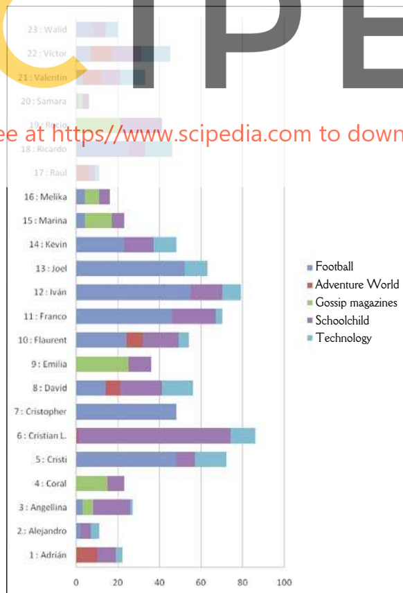
Figure 1: Importance of thematic categories for Primary Education pupils at CEIP «La Paloma».

for complementing the observations recorded in our field notebooks 2 . We agree with Wolcott (2003) that if all ethnography demands that we observe the cultural aspects of behaviour to find common patterns, we need to focus our attention not only on actions but also delve into the meanings that these actions have for the social actors involved. Our direct observation of reality, together with the data and information provided by the pupils when they spoke about and discussed the audio-visual narratives, reassessed the subjectivity, interaction and exchange of meaning between the researcher, the pupils and the context in which they were acting and relating to each other (Bautista, 2009; Burn, 2010; Kushner, 2009). To paraphrase Kushner (2009: 10) «the audio-visual has the power to provoke intersubjectivity». This is a fundamental epistemological process for understanding the function and value that audio-visual narratives have in constructing true and consistent knowledge of the Other that, in turn, will allow the intercultural relationship to run smoothly and strongly. But, how did we get