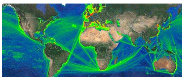
Figure 1: Worldwide AIS positions acquired by satellites (ORBCOMM)

©2017, Copyright is with the authors. Published in Proc. 20 th International Conference on Extending Database Technology (EDBT), March 21-24, 2017 - Venice, Italy: ISBN 978-3-89318-073-8, on OpenProceedings.org. Distribution of this paper is permitted under the terms of the Creative Common License CC-by-nc-nd 4.0.