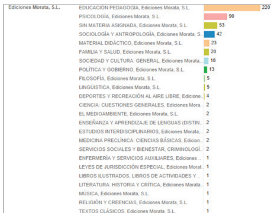
Figure 3. Example of book publisher disciplinary profile. Distribution of titles among disciplines for Ediciones Morata .

SPI has progressively included more information regarding the original manuscript selection process of scholarly book publishers. Both evaluators and readers expect the texts have been reviewed or validated by experts in the field.