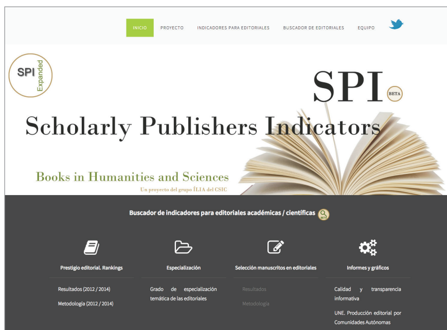
Figure 2. Scholarly Publishers Indicators (SPI) http://ilia.cchs.csic.es/SPI

This prestige has been identified through two large surveys sent to Spanish lecturers and researchers in all fields of the Humanities and Social Sciences. The 2012 and 2014 editions of the survey were sent to over 11,000 scholars. Response rates (26% and 23.05% respectively) can be considered high for this type of studies and, although there is variance among the disciplines, the results show a gradation of perceived book publishers' prestige in each field and prestige concentration in a core of book publishers. The number of ‘mentions’ for each book publisher as well as the position in which they have been voted are included in the data for the calculation of the book publishers' prestige indicator (Giménez-Toledo; Tejada-Artigas; Mañana-Rodríguez, 2013). This indicator has enabled the construction both disciplinary and general rankings for all the fields studied.